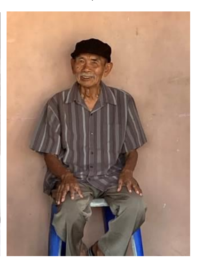
Participant in the seniors' programme