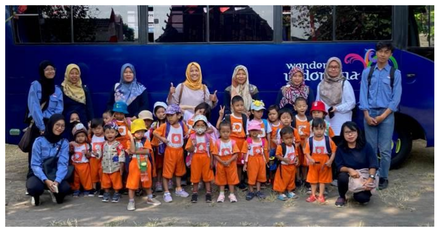
Children of the Rumah Kita nursery and their supervisors at their outing to the mini-zoo.

We also visited four elderly people in their homes. They had been proposed by the neighbourhood representatives as candidates for the seniors' support programme in their neighbourhood and had to pass the "test". It was up to us to form an opinion based on a visual assessment and a brief interview about income and live-in children/grandchildren. Things are not always what they seem.