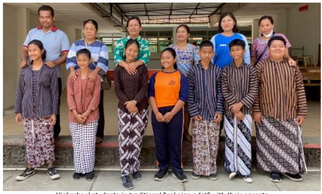
Highschool students in traditional "pakaian adat" with their parents

Over the course of three weeks, all the projects were visited: the nursery Rumah Kita (including an difficult meeting about whether or not to continue funding it), the six groups of senior citizens and several schools (including the school in Gunung Kidul, an hour and a half's drive from the city, traffic jams included). We paid visits to students' homes and together with students we visited a state-of-the-art agricultural project on the top of the hills near Imogiri, where an internship might be possible for them. There were also several meetings with parents, successful students who were rewarded with a lease laptop and three graduates. Two outings were organised. The first outing was with the children from the day care centre to the mini zoo; a kind of petting zoo, but with local animals. Besides goats and rabbits there were snakes, iguanas, mustelids, turtles and parrots. The second outing was with 100 senior citizens to Rumah Kita's big pendopo to be entertained by the volunteers and to dance, sing and - of course - eat together.