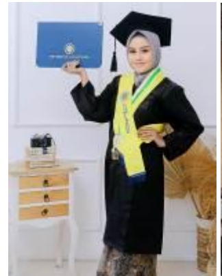
With honours: S1 Chemie

The President of Indonesia (Jokowi) has a very good press and his plans to improve access to certain facilities for the grassroots people (our target group) are having an effect on health and education. The city of Yogyakarta gives the impression that the economy is doing well: it has become a magnet for local tourism, plays an important role in national history (in the Merdeka armed conflict), and the presence of the Sultan and the Craton, Borobudur and Prambanan also attracts a large audience.