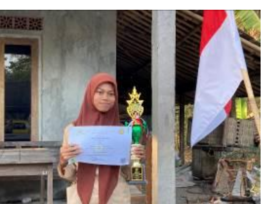
Mathematics award at regional Olympiad